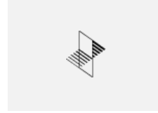
145-20700, W 2 pcs of wall fastening Lina45