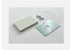
145-50102, B 2 x end cap - metal, screwless