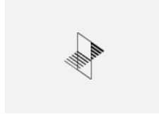
145-20700, S 2 pcs of wall fastening Lina45