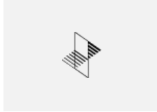
145-20700, B 2 pcs of wall fastening Lina45