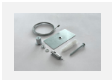
145-50303, N wire suspension for joint 2000mm - 1 pc + metal handle