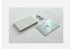
145-50102, W 2 x end cap - metal, screwless