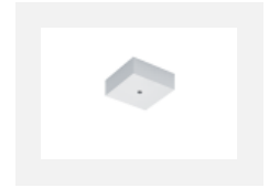
00-00370, W ceiling cup 80x80x32mm