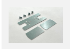
145-50200, F direct connector with caps of clearance