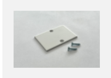
145-50101, B 2 x end cap - metal, screw