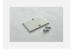
145-50101, W 2 x end cap - metal, screw