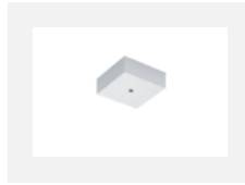
00-00370, W ceiling cup 80x80x32mm