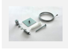
145-50301, N wire suspension 4000mm - 1 pc + metal handle