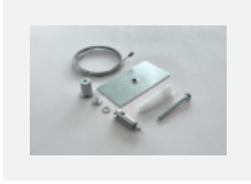
145-50304, N wire suspension for joint 4000mm - 1 pc + metal handle