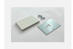
145-50102, S 2 x end cap - metal, screwless