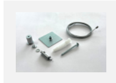
145-50302, N wire suspension 6000mm - 1 pc + metal handle