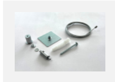
145-50301, N wire suspension 4000mm - 1 pc + metal handle