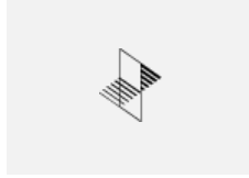
145-20700, S 2 pcs of wall fastening Lina45