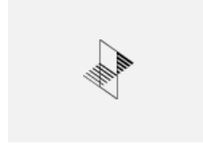
145-20700, W 2 pcs of wall fastening Lina45