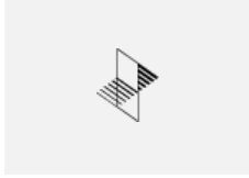
145-20700, B 2 pcs of wall fastening Lina45