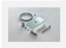
145-50304, N wire suspension for joint 4000mm - 1 pc + metal handle