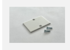
145-50101, W 2 x end cap - metal, screw