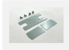
145-50200, F direct connector with caps of clearance