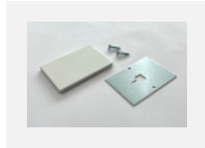
145-50102, B 2 x end cap - metal, screwless