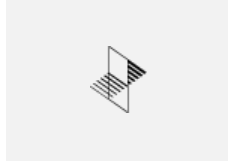
145-01200, F Accessory for gear-tray release for Lina145