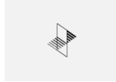
145-20700, W 2 pcs of wall fastening Lina45