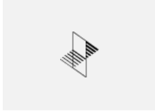
145-20700, B 2 pcs of wall fastening Lina45