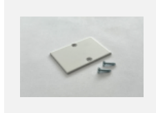
145-50101, W 2 x end cap - metal, screw