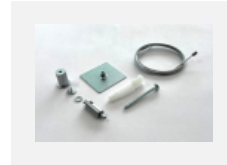
145-50300, N wire suspension 2000mm - 1 pc + metal handle