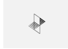
145-20700, W 2 pcs of wall fastening Lina45