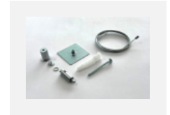
145-50301, N wire suspension 4000mm - 1 pc + metal handle