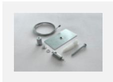
145-50303, N wire suspension for joint 2000mm - 1 pc + metal handle