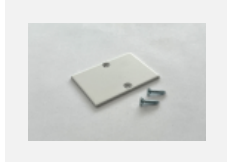
145-50101, S 2 x end cap - metal, screw