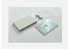
145-50102, W 2 x end cap - metal, screwless