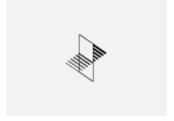
145-01200, F Accessory for gear-tray release for Lina145