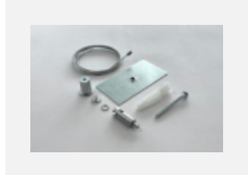
145-50303, N wire suspension for joint 2000mm - 1 pc + metal handle