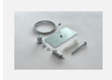
145-50305, N wire suspension for joint 6000mm - 1 pc + metal handle