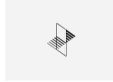
145-20700, S 2 pcs of wall fastening Lina45