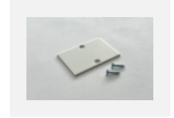
145-50101, W 2 x end cap - metal, screw