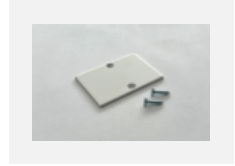
145-50101, B 2 x end cap - metal, screw