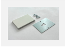
145-50102, B 2 x end cap - metal, screwless