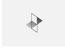
145-20700, B 2 pcs of wall fastening Lina45