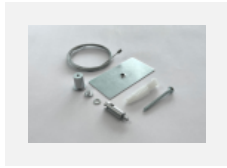
145-50305, N wire suspension for joint 6000mm - 1 pc + metal handle