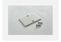
145-50101, B 2 x end cap - metal, screw