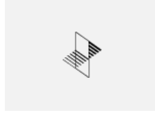
145-01200, F Accessory for gear-tray release for Lina145