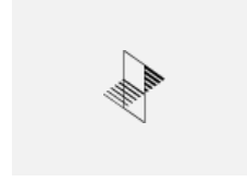
145-20700, W 2 pcs of wall fastening Lina45