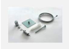
145-50302, N wire suspension 6000mm - 1 pc + metal handle