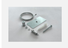
145-50303, N wire suspension for joint 2000mm - 1 pc + metal handle