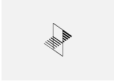
145-20700, B 2 pcs of wall fastening Lina45