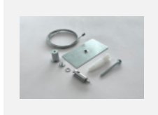
145-50304, N wire suspension for joint 4000mm - 1 pc + metal handle