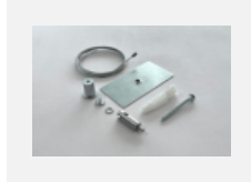
145-50305, N wire suspension for joint 6000mm - 1 pc + metal handle