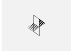
145-20700, S 2 pcs of wall fastening Lina45