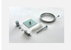
145-50302, N wire suspension 6000mm - 1 pc + metal handle