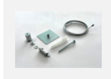
145-50300, N wire suspension 2000mm - 1 pc + metal handle