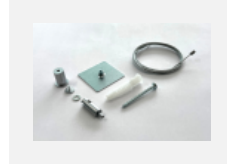
145-50300, N wire suspension 2000mm - 1 pc + metal handle