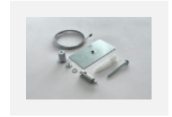
145-50303, N wire suspension for joint 2000mm - 1 pc + metal handle