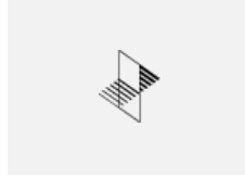
145-20700, B 2 pcs of wall fastening Lina45