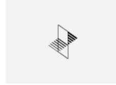
145-20700, S 2 pcs of wall fastening Lina45