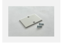
145-50101, S 2 x end cap - metal, screw