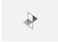
145-20700, S 2 pcs of wall fastening Lina45