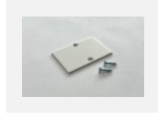
145-50101, S 2 x end cap - metal, screw