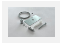
145-50303, N wire suspension for joint 2000mm - 1 pc + metal handle