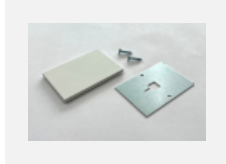
145-50102, B 2 x end cap - metal, screwless