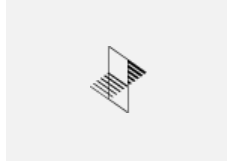
145-01200, F Accessory for gear-tray release for Lina145