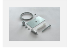
145-50303, N wire suspension for joint 2000mm - 1 pc + metal handle