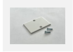
145-50101, S 2 x end cap - metal, screw