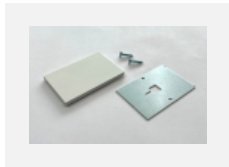
145-50102, W 2 x end cap - metal, screwless