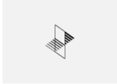
145-20700, B 2 pcs of wall fastening Lina45