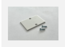
145-50101, B 2 x end cap - metal, screw