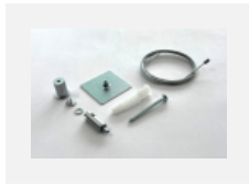
145-50300, N wire suspension 2000mm - 1 pc + metal handle