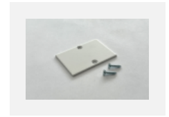
145-50101, S 2 x end cap - metal, screw