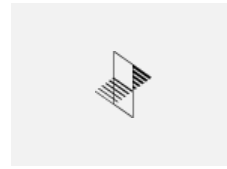
145-20700, S 2 pcs of wall fastening Lina45