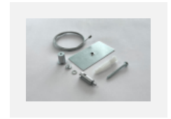
145-50303, N wire suspension for joint 2000mm - 1 pc + metal handle