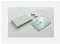
145-50102, S 2 x end cap - metal, screwless