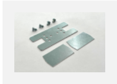
145-50200, F direct connector with caps of clearance