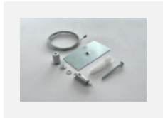
145-50305, N wire suspension for joint 6000mm - 1 pc + metal handle