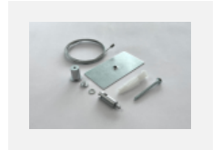
145-50303, N wire suspension for joint 2000mm - 1 pc + metal handle