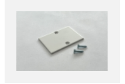
145-50101, B 2 x end cap - metal, screw