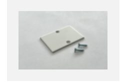
145-50101, W 2 x end cap - metal, screw