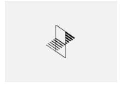
145-01200, F Accessory for gear-tray release for Lina145