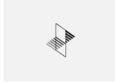
145-20700, S 2 pcs of wall fastening Lina45