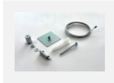
145-50301, N wire suspension 4000mm - 1 pc + metal handle