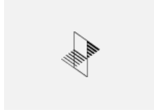
145-01200, F Accessory for gear-tray release for Lina145