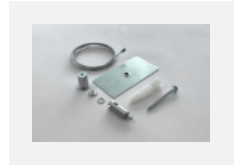
145-50303, N wire suspension for joint 2000mm - 1 pc + metal handle