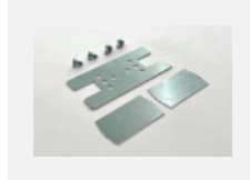
145-50200, F direct connector with caps of clearance