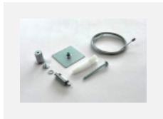
145-50300, N wire suspension 2000mm - 1 pc + metal handle