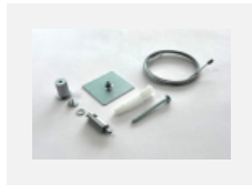
145-50302, N wire suspension 6000mm - 1 pc + metal handle