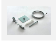
145-50302, N wire suspension 6000mm - 1 pc + metal handle