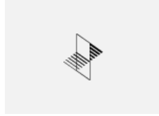
145-20700, W 2 pcs of wall fastening Lina45