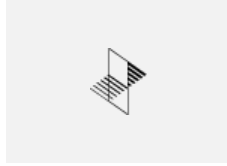
145-01200, F Accessory for gear-tray release for Lina145