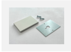
145-50102, W 2 x end cap - metal, screwless