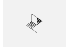
145-01200, F Accessory for gear-tray release for Lina145