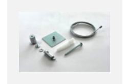
145-50302, N wire suspension 6000mm - 1 pc + metal handle