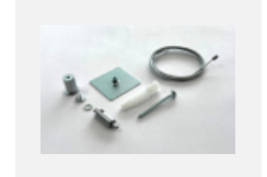
145-50302, N wire suspension 6000mm - 1 pc + metal handle