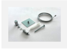
145-50300, N wire suspension 2000mm - 1 pc + metal handle