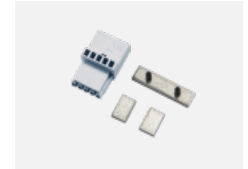
132-50200, F straight connector